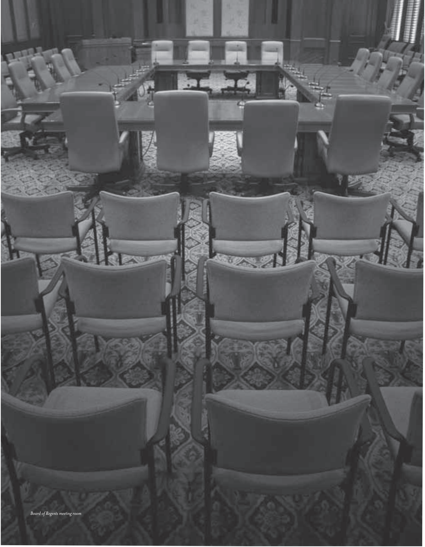
Board of Regents meeting room