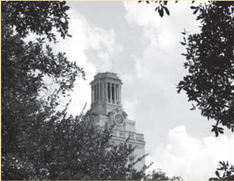
The University of Texas at Austin Tower