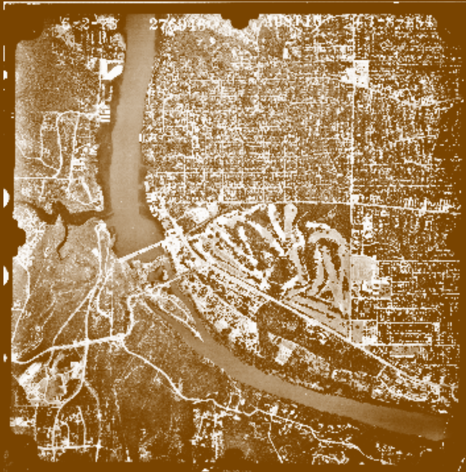
Aerial view of West Austin, Summer of 1975