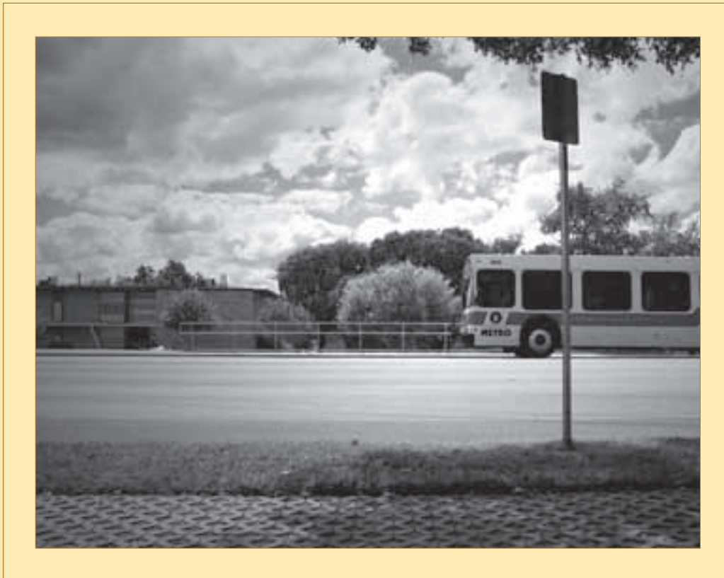
The Colorado Apartments on the Brackenridge Tract