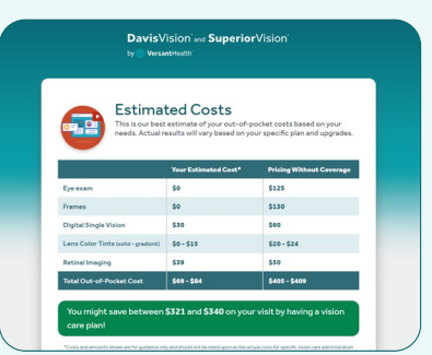
Demonstrating in-network value

The costs and amounts shown are for guidance only, should not be relied upon as the actual costs for specific vision care services, and are based on in-network eye care providers only. These costs are not intended to reflect your exact costs for services and are subject to change based on your coverage, benefits, and authorization for services. © 2024 Versant Health Holdco, Inc. All rights reserved. Davis Vision® and Superior Vision® are trademarks of Versant Health Holdco, Inc., a wholly owned subsidiary of MetLife, Inc.