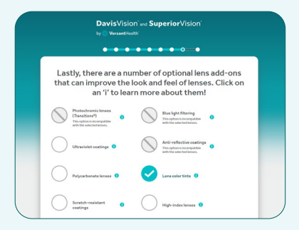
Navigating lens options